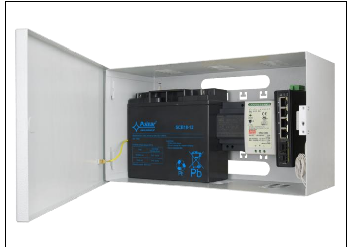
Fig.2 Mounting DIN rails on plastic brackets – 20mm (standard equipment)