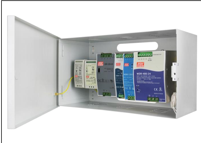
Fig.1 Examples of configurations