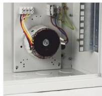
Transformers series: TOR...