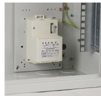
Transformers series: TRP...