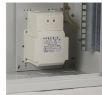
Transformers series: TRZ...