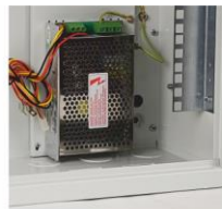
Enclosed PSU series: PS..., PSB...