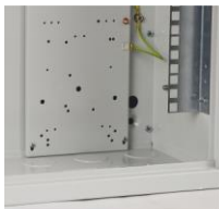
Empty mounting plate