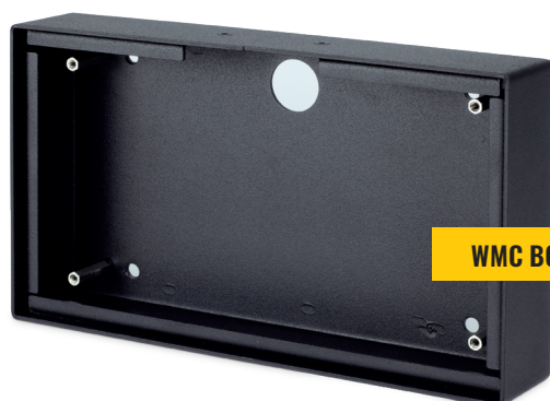
WMC BOX W