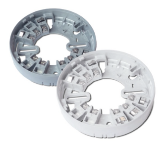
Separate bases - detail