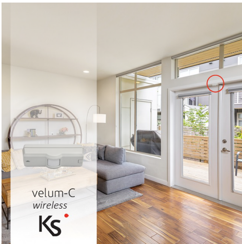
velum-C wireless KS

velum-C wls detector is a curtain motion detector that can be installed on the ceiling with a 6m vertical flow. In this way, positioned at the center of the frame, it ensures its complete coverage, creating an insurmountable barrier to any intruder.