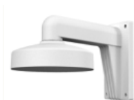
Indoor/outdoor wall mount DS-1272ZJ-110-TRS