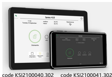
code KSI2100040.302 code KSI2100041.302