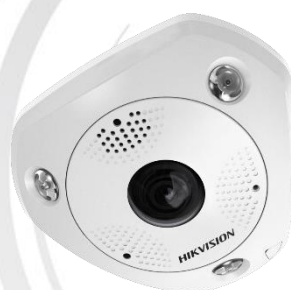
With -V Model