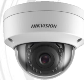
2.8 mm Fixed Lens