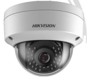
4 mm Fixed Lens