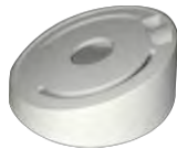
Inclined ceiling mount