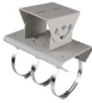
DS-1214ZJ Horizontal pole mount