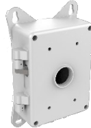
DS-1674ZJ Junction Box (The bracket should be used together with DS-2202ZJ)