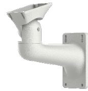
DS-2202ZJ Integrated Mount