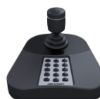
DS-1005KI USB Joy-stick

*DS-1673ZJ should be used with DS-1661ZJ or DS-1602ZJ.