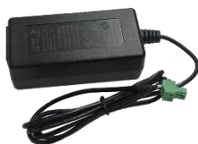
ASW0081-1220002W Power adapter