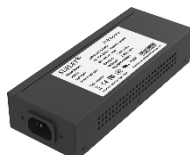
LAS60-57CN-RJ45 Hi-PoE midspan