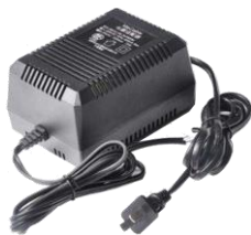
TEAC-66-243000V (EU) MKAC-66-243000U (USA) TEAC-66-243000VB (UK) Power adapter (for outdoor model)