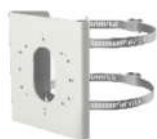
DS-1275ZJ-S-SUS Vertical Pole Mount