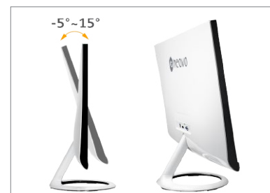
User-friendly designed stand allows to tilt from -5° ~ 15°