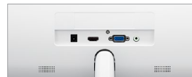
Built-in HDMI input makes the FM-24 easy to be paired with Full HD multimedia devices