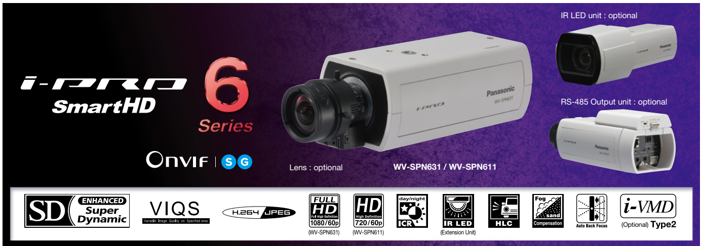
*1-VMD Type2 : Intruder Detection / Loitering Detection / Direction Detection / Scene Change Detection / Object Detection / Cross Line Detection